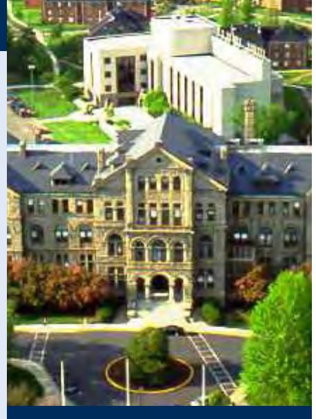
The Catholic University of America in Washington, D.C.

Companies can leverage technical staff (including alumni of certain targeted universities) and ask them to work with human resources/recruiting to convey this need for basic education on standards. Industry executives with technical backgrounds often sit on university advisory boards or are asked to teach technical courses. These industry leaders can influence the decision (continued)