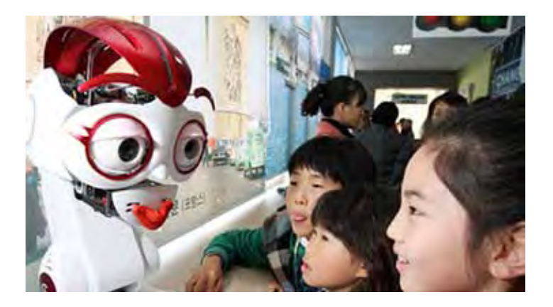
More than half of Korea's kindergartens will have intelligent service robots in their classrooms by 2012.

Indeed, all those categories of robots he described at the time as niche have since become more commonplace and, in some cases, quite widespread. In 2010 there were approximately 200 companies producing or developing service robots on a global basis for industrial tasks such as the dismantling of nuclear power stations, or domestic tasks such as cleaning floors or mowing the lawn.